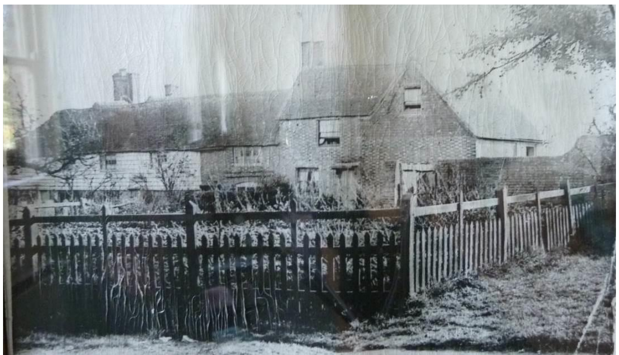
Figure 2: Pre-1897 photo of the meeting house without the 1898-99 extension (Herstmonceux Meeting House)